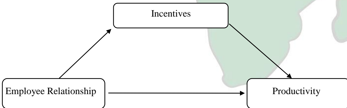
Figure 1 Research conceptual frame work

H4: Employee Incentives mediates the relationship between employee relationship and productivity